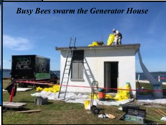
Busy Bees swarm the Generator House