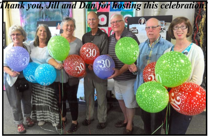
PNEHS Presidents enjoy the party.