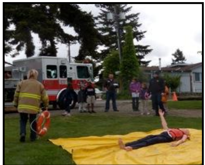
Students learn to throw life preser to manequin