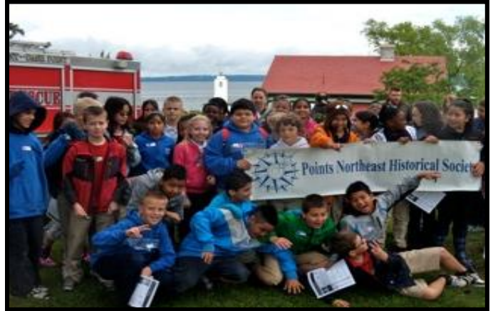
250 local students converge on the Park for history field trip