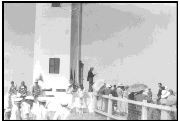
Current Lighthouse at dedication in 1933