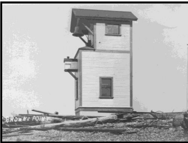
First Lighthouse built in 1903

This year marks the 110th Anniversary of the dedication of the first lighthouse (1903) and the 80th Anniversary of the present lighthouse. At that original dedication ceremony in October 1903, the area was officially renamed from Point Brown to Browns Point. (See page 5). It is in a sense, our community's birthday. Anyone interested in helping to plan a community birthday party, call our message phone at 253-927-2536 or Jim Harnish at 253- 927-6019.