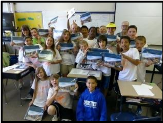
WE GOT BOOKS!