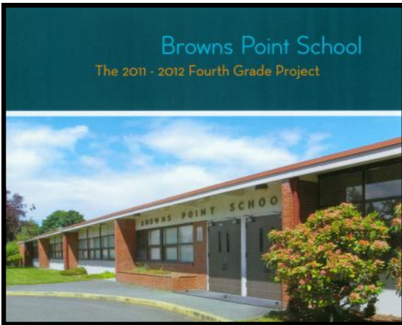
Ta da! The Finished Project. 88 students may now say they are “published authors”.