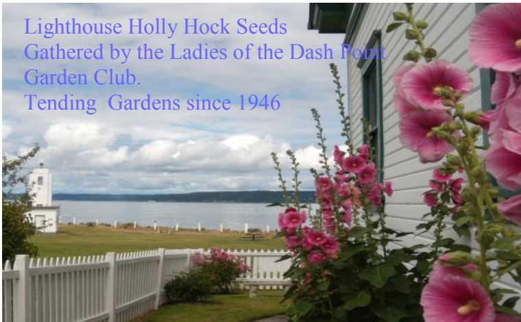
Lighthouse Holly Hock Seeds Gathered by the Ladies of the Dash Point Garden Club. Tending Gardens since 1946