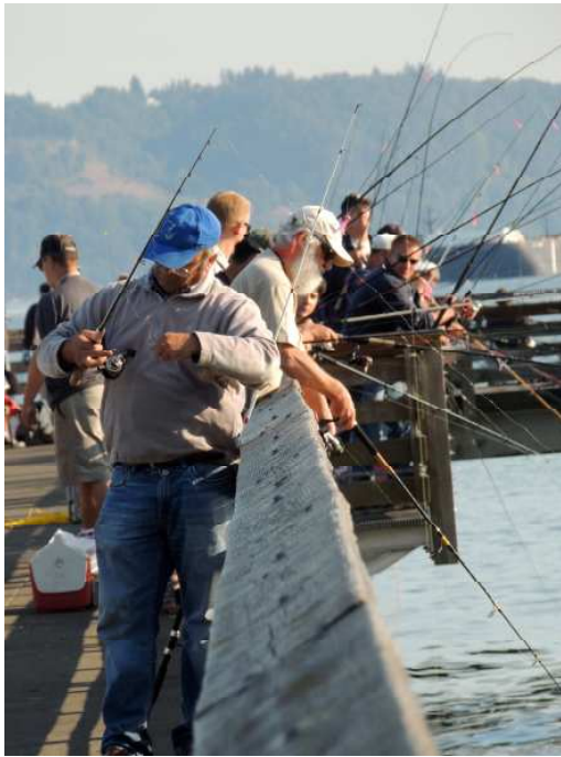
In pursuit of the wily “pinks” at Dash Point Fishing Pier, but it will always be our Dock .