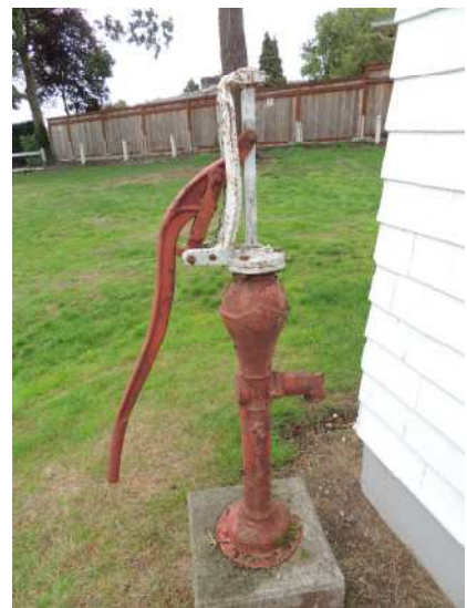
Donated old water pump installed next to the old pump house which we now call the Bell House