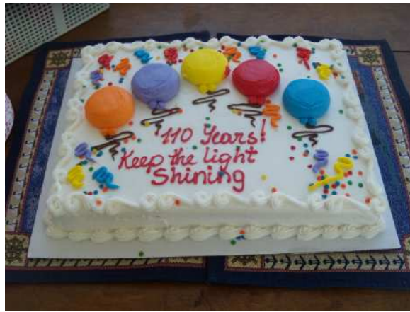
“ Keep the Light Shining” Birthday Cake for the 110th birthday of the Browns Point Lighthouse and the change of a new name from Point Brown to Browns Point.