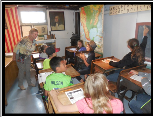
There's the black board on the right