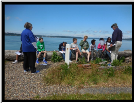
Learning about our lighthouse.