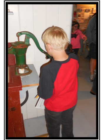
A pump in the kitchen?