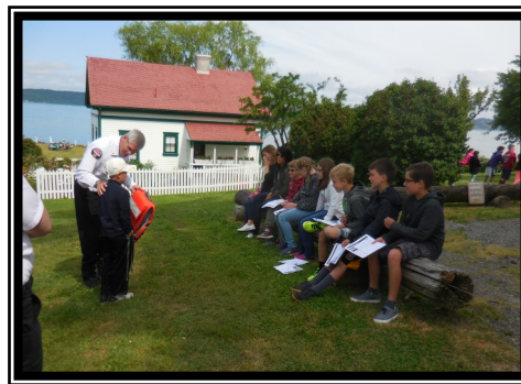
The fire people and fire truck...always a hit