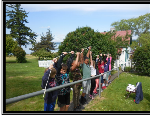
Tying knots is difficult but rewarding