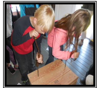
Drilling takes a lot of work!

NEVER TOO EARLY TO MARK YOUR CALENDAR PNEHS ANNUAL CHRISTMAS TEA SUNDAY DECEMBER 10TH 1-4 P.M.